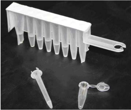
Figure 1. The Maxwell® 16 Low Elution Volume plasticware. The plasticware is designed to accommodate large sample input volumes and low elution volumes.